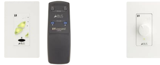
Russound A-BUS A-KP2 amplified keypad and A-KPRC handheld remote control