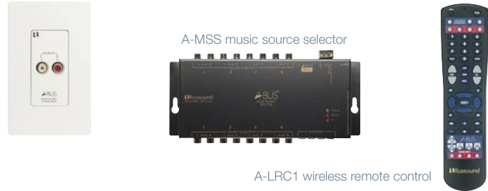
A-LRC1 wireless remote control