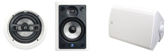
Russound Advantage® in-ceiling/in-wall speakers