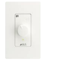
Russound A-BUS A-VC2 amplified volume control

The keypad provides buttons for on/off and volume, as does the remote control, which you simply aim at the keypad. The volume control adjusts volume for the selected source. Both the keypad and the A-BUS volume control contain an amplifier that powers a pair of speakers.