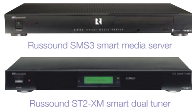
Russound SMS3 smart media server