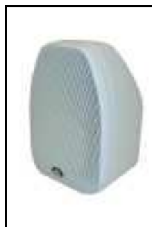
334 NEXUS IR CORNER SPEAKER

Complement your home with in ceiling speakers. Nexus ceiling speakers have in built IR receivers for a simple elegant installation. A range of speakers are available for different situations in both stereo and home cinema configurations.