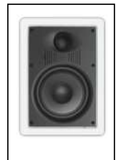
305 NEXUS IR WALL SPEAKER