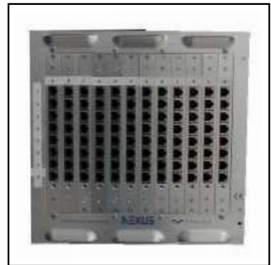
272 NEXUS PATCH PANEL