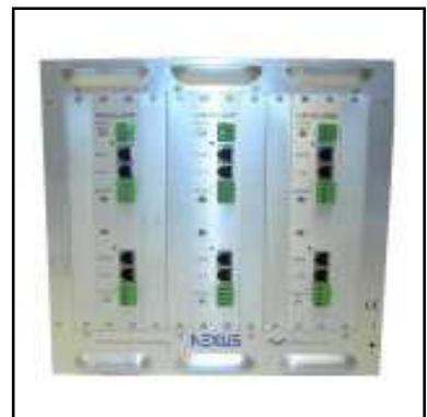
261 NEXUS MODULAR AMPLIFIER