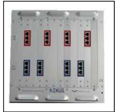
20X NEXUS MODULAR AV HUB