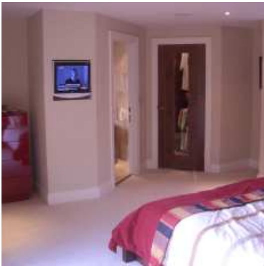
Images of Nexus installation kindly provided by I-Solutions 5, Bournemouth.