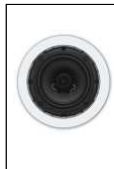
302 NEXUS IR CEILING SPEAKER